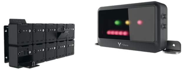
Y.Share's EasY.Box & DST Pro devices

For agile, high-growth companies like Y.Share, connectivity management tasks pertain to not only technical and operations teams but also other non-technical teams when the situation calls for it.